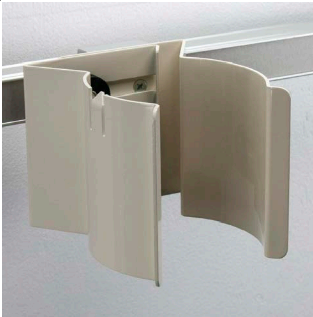
Wipes Dispenser Mount Clamp On #604201

For use with Eclipse™ Horizontal Equipment Rail # 050453 And F Type Eclipse™ Equipment Rail # 050469