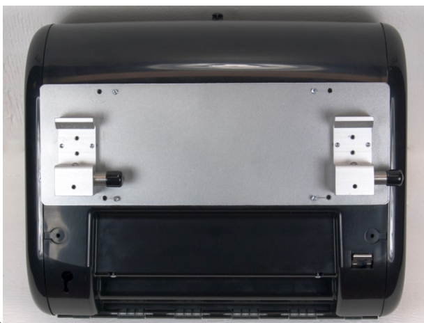
Softpull/ Bobrick Paper Towel Dispenser Mount Ohio Rail #804500

For use with Ohio/Ohmeda Horizontal Equipment Rail #050511