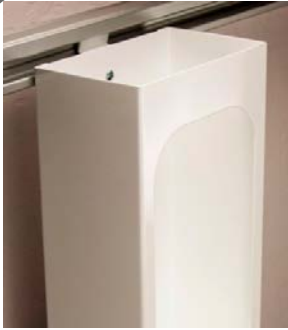
Single Glove Box Holder Rapid Mount #614000

For use with Eclipse™ Horizontal Equipment Rail #050453