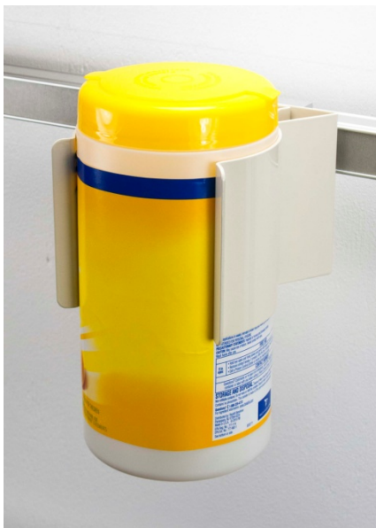
Wipes Dispenser Mount Ohio Rail Mount # 804201

For use with MA Horizontal Equipment Rail # 050443