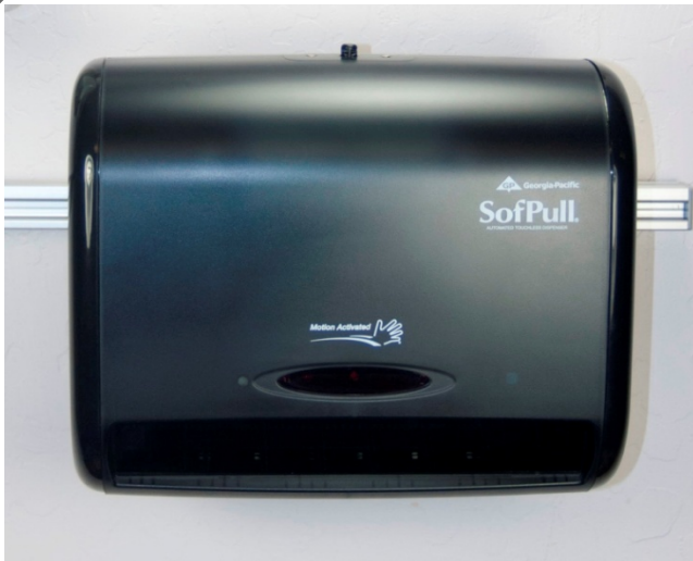
Softpull/ Bobrick Paper Towel Dispenser Mount Clamp On #604500

For use with Eclipse™ Horizontal Equipment Rail # 050453 And F Type Eclipse™ Equipment Rail # 050469