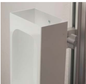
Single Glove Box Holder Unimount™ # 504000

For use with Unimount™ Vertical Equipment Track #050466