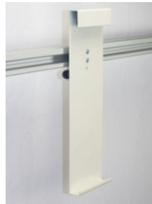
Waste Basket Holder Clamp On #604601

For use with Eclipse™ Horizontal Equipment Rail # 050453 And F Type Eclipse™ Equipment Rail # 050469