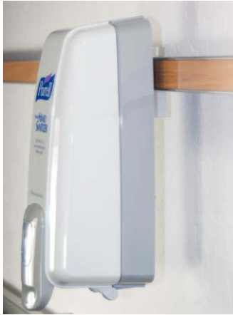
SharpSmart/ Soap/ Sanitizer Mounting Bracket Clamp On #604102 (shown) #604200