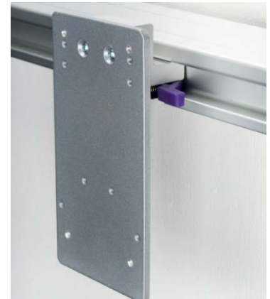
SharpSmart/ Soap/ Sanitizer Mounting Bracket Ohio Rail Mount #804102 #804200

For use with MA Horizontal Equipment Rail # 050443