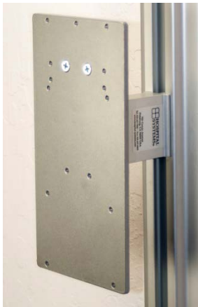
SharpSmart/ Soap/ Sanitizer Mounting Bracket Unimount #504102 #504200 (shown)

For use with Ohio/Ohmeda Horizontal Equipment Rail #050511