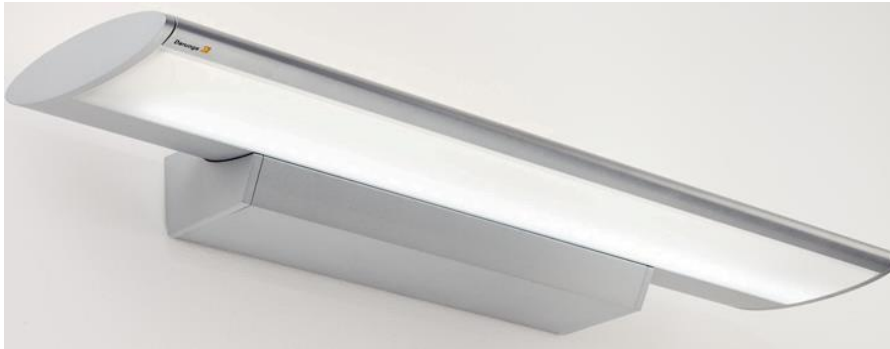
Amadea® Over Bed Light LED 3ft Unit #173614 4ft Unit #174814

Provides Indirect, Exam and Reading light options. Unit has an optional low voltage controller available for remote bed control