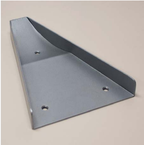
Bed Shoe #090800

Weight: 3lbs Dimensions: 12.125" x 8.125"