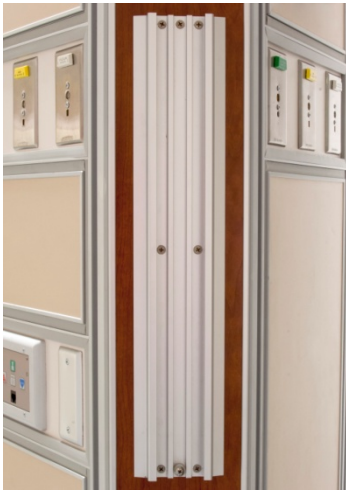
Wall / Panel Mounted Monitor Slide – 19” #909500

Additional lengths available contact HSI for details