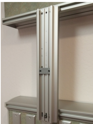
Dual Infinity™ Rail Mounted Monitor Slide/Spanner #909522 – 18 ¼” # 909521 – 25 ¼” #909520 – 31 ¼”

For use on Infinity™ Headwalls Or Eclipse Rails #050453